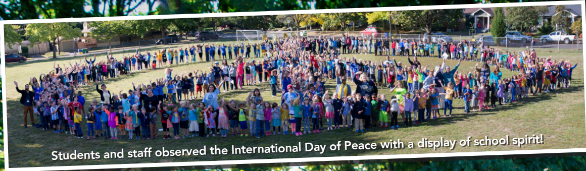
Students and staff observed the International Day of Peace with a display of school spirit!