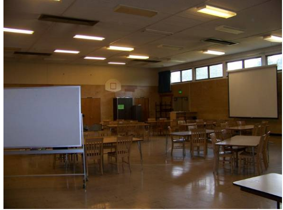
Main building (274A), playroom, looking northwest.