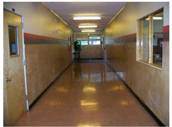
Main building (274A), rear hallway at office, looking east.