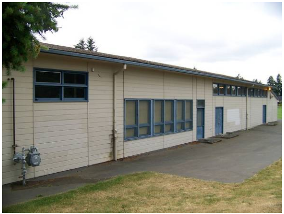
Main building (274A), north (rear) elevation, looking southwest.