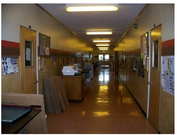
Main building (274A), central hall with main entrance at end, looking south.