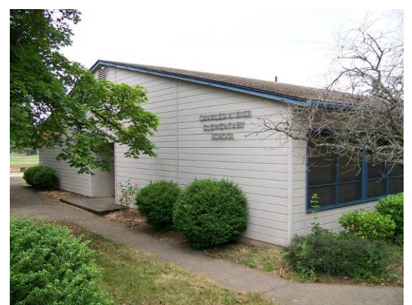
Main building (274A), south (front) and east (side) elevations, looking northwest.