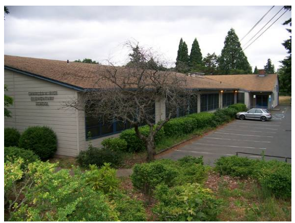
Main building (274A), south (front) and east (side) elevations, looking northwest.