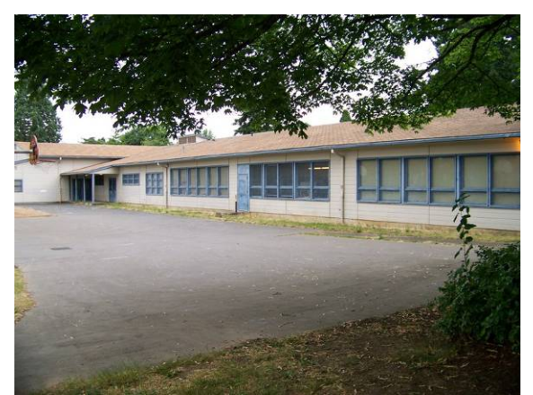
Main building (274A), west (side) elevation, looking northeast.

Rice Facility Exterior Photos ENTRIX, 2009