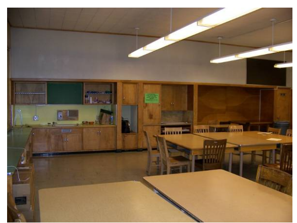
Main building (274A), classroom, looking south.