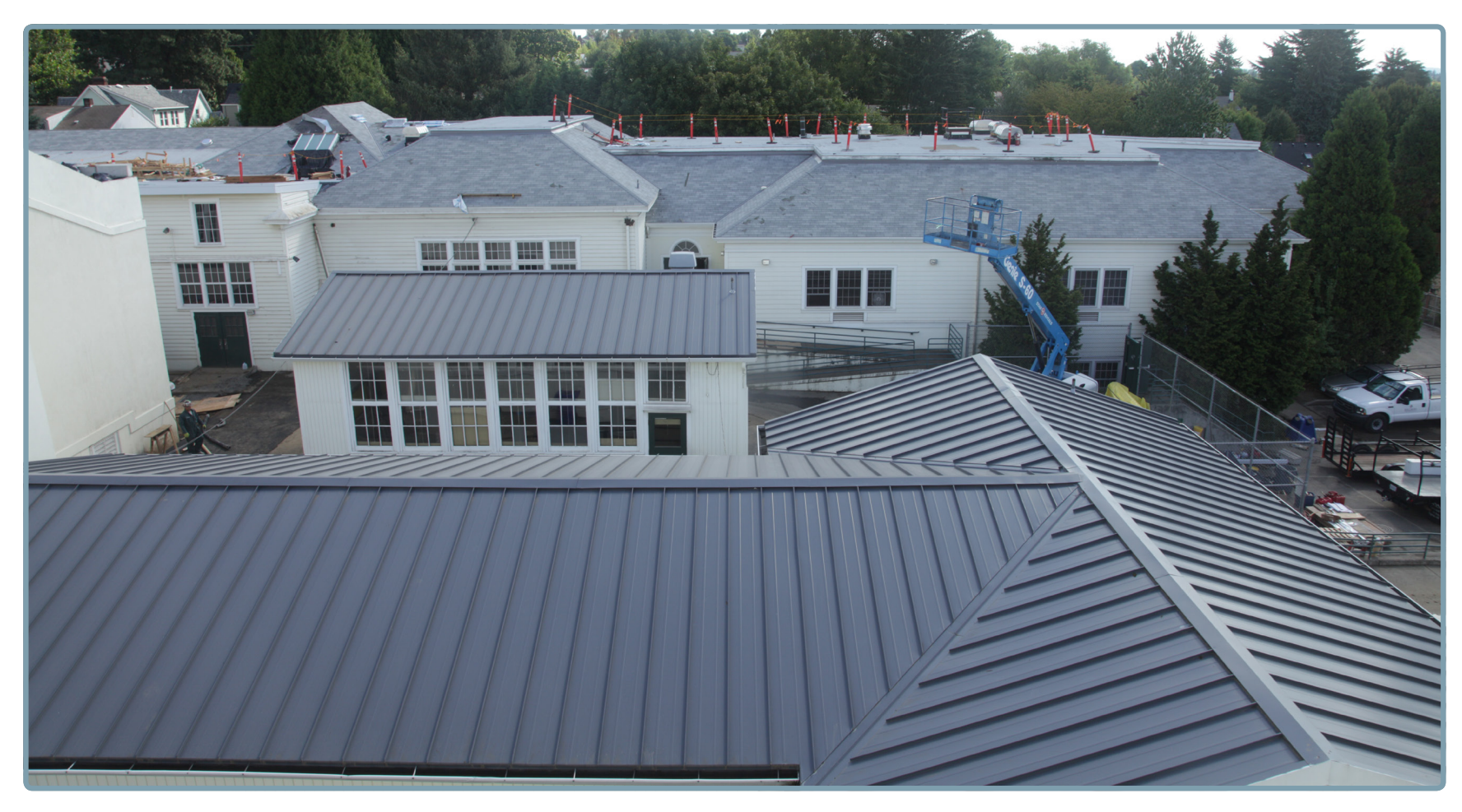
Complete roof replacement with seismic strengthening, new skylights and mechanical equipment added