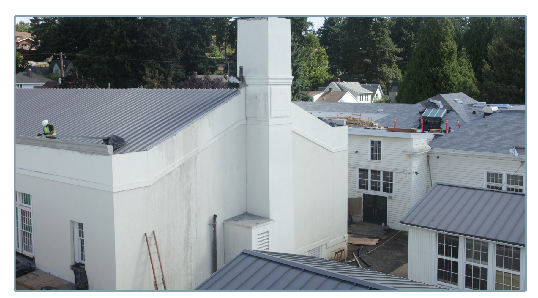
Seismic strengthening of the cafetorium

Alameda is one of five schools that were successfully upgraded this summer. All the work was completed on time and on budget.