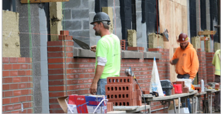
Brick finishing work