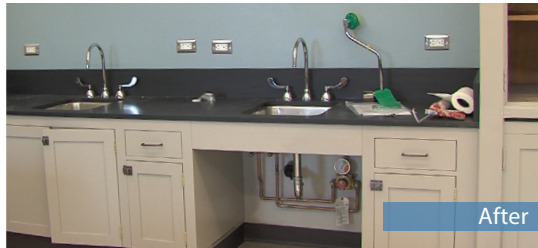
Science classroom improvements - new overhead electrical outlets, accessible sinks, eyewash stations, and cabinets

Arleta K-8 is one of twelve schools that were successfully upgraded this summer. All the work was completed on time and on budget. During the 8 years of the Bond program, Portland Public Schools will upgrade up to 63 schools.