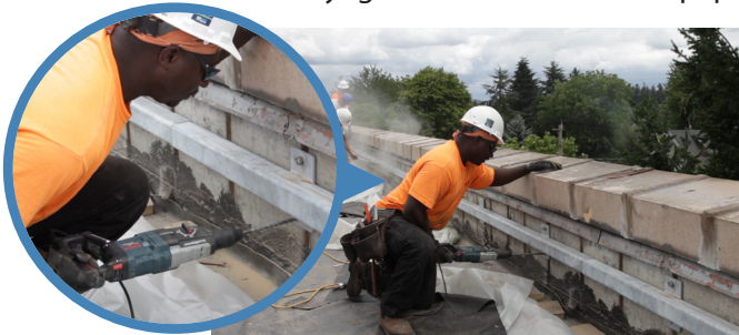
Building level seismic strengthening

Complete roof replacement with seismic strengthening Plywood roof diaphragm added to make the roof function as a single unit New skylights and mechanical equipment added