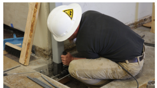
Building level seismic strengthening for added safety