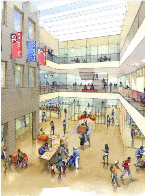
Faubion Welcome Hall