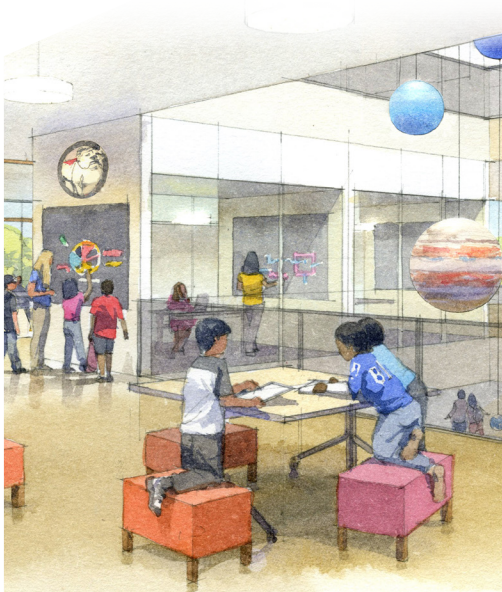
Flexible Classroom Space