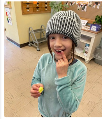
Kids Growing Up and Losing Teeth!