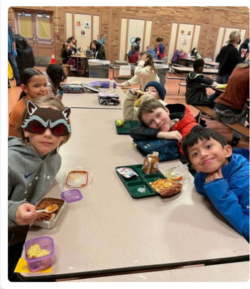
Thursday is Pizza Day!