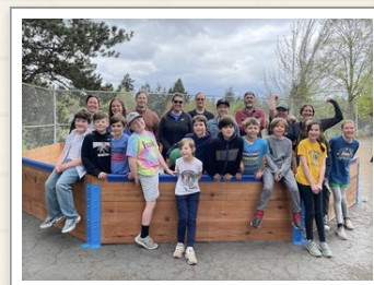
5th Grade Families Donate Gaga Ball Pit!