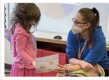
Sharing Winter Break Memories