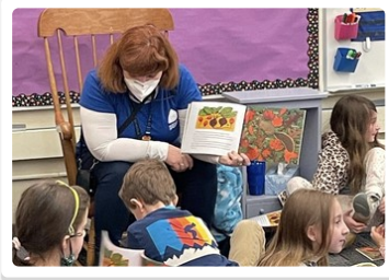
2nd Grade Reading Fun