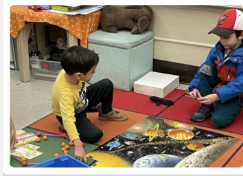
Outer Space Puzzle Time