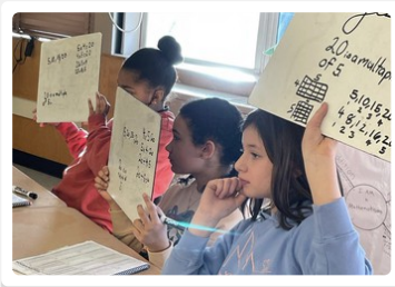
4th Grade Math Masters

All Friday Flyer messages are archived on the Bridlemile elementary school website.