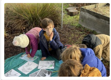
Beagles Back in the Garden