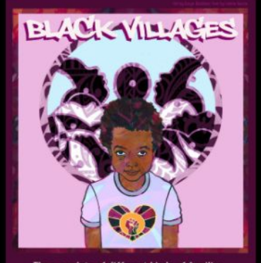
There are lots of different kinds of families; what makes a family is that it's people who take care of each other; those people might be related, or maybe they choose to be family together and to take care of each other. Sometimes, when it's lots of families together, it can be called a village.

families; what makes a family is that it's people who take care of each other. It's important to make sure that all families feel welcome.