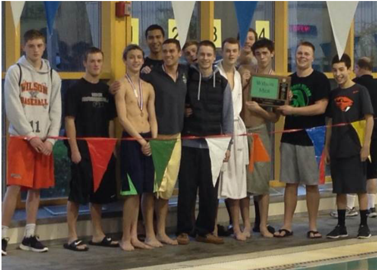
Boys Team Wins District