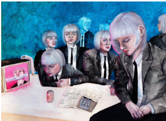
by Idit Cahana