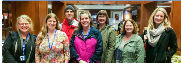
Sabin teachers attending the IB Portland Conference