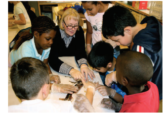
3rd grade students dissecting a squid.