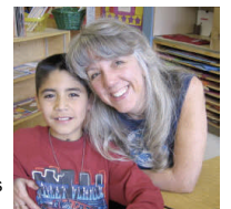
SMART reading partners

Hayhurst School welcomes and encourages community involvement during the school day. Community groups that volunteer in the classrooms include: Intel, the Bureau of Environmental Services, OASIS, PSU tutoring, Lewis and Clark College mentors, Vermont Hills Methodist Church, Wilson High School, and the SMART reading program.