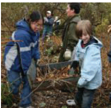
5th grade students restoring a creek bed as part of the $30,000 Metro grant received in partnership with Wilson High School.

Teachers integrate core subject areas utilizing the district-adopted curriculum at each grade level, including a balanced approach to literacy,