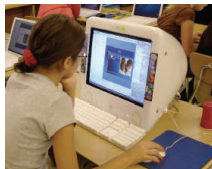
Working on a Power Point project.

Hayhurst School is wireless and networked. The state-of-the-art computer lab has eMac desktops, iBook laptops, digital cameras, video cameras, digital microscopes, AlphaSmarts and an interactive demonstration board. Every classroom has a mini-