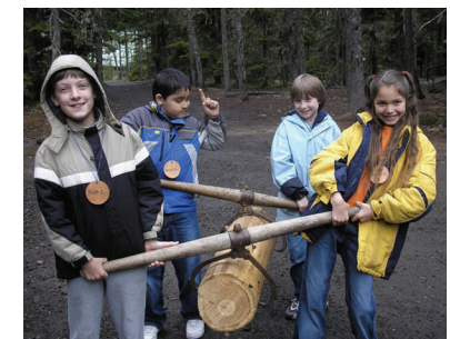
4th grade students at the overnight Oregon Trail study

Hayhurst Neighborhood School is a caring community of active learners committed to meaningful education in a respectful and cooperative environment.