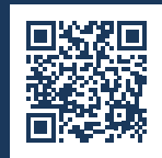
QR for survey

Use the QR code below to let us know who you think will benefit or be burdened by the proposed changes, and ways to improve the recommendations. Your input will be shared with the PPS Board of Education, who will vote on the changes on May 24.