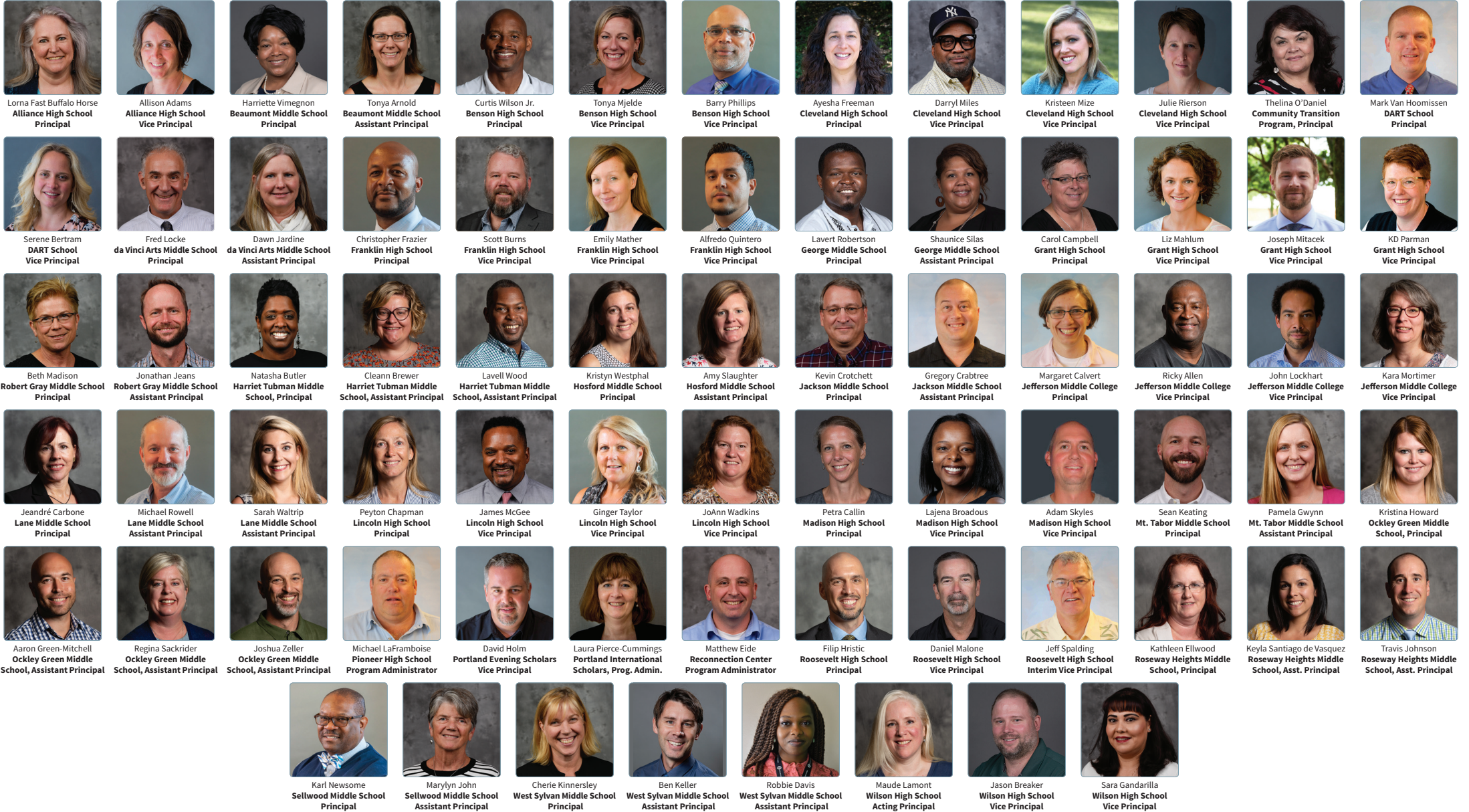
Row of portraits for Middle and High Schools leadership, including principals and assistant principals for schools like Alliance High School, Benson High School, Cleveland High School, etc.