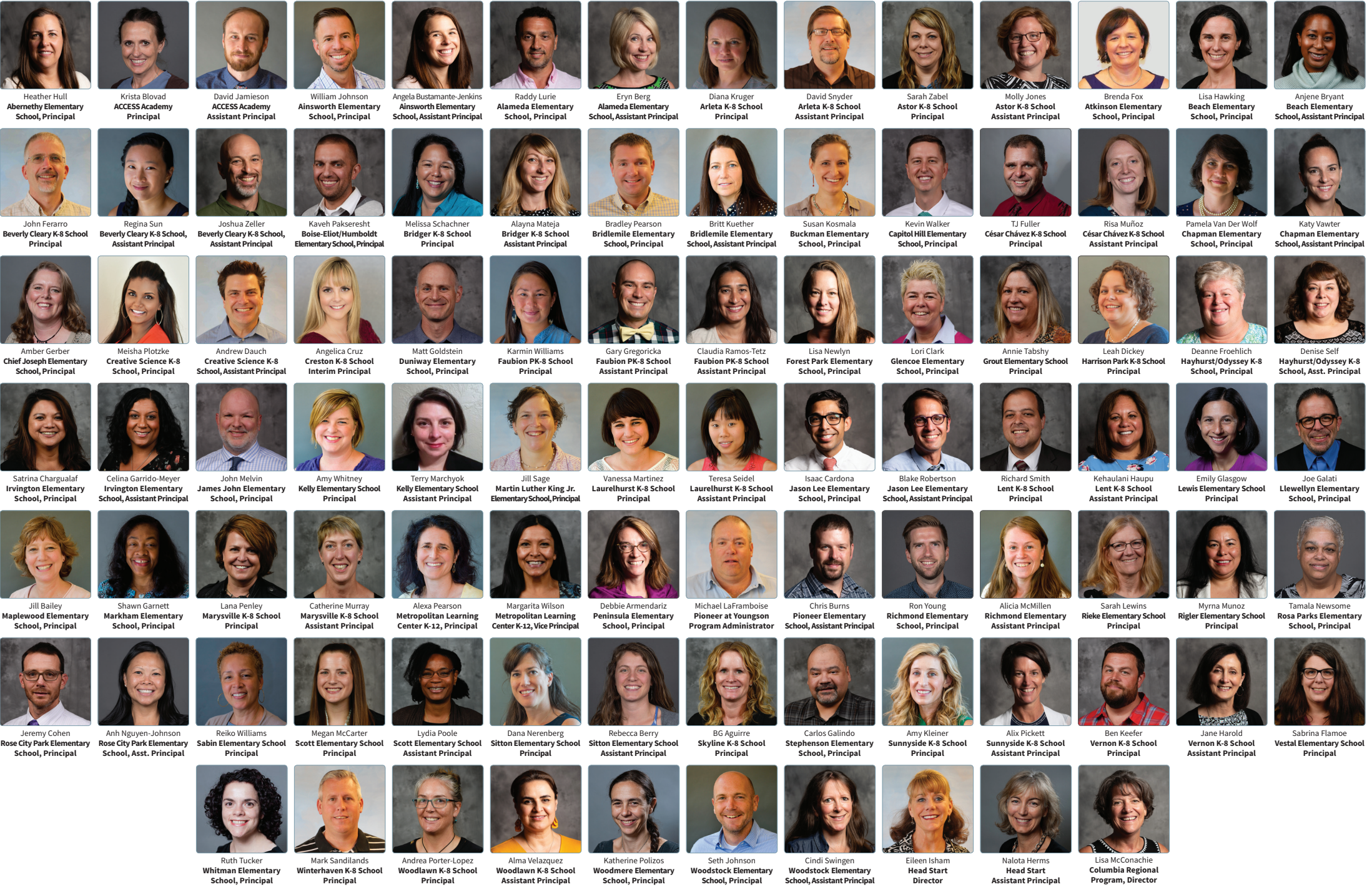
Row of portraits for Elementary, K-8 Schools and Head Start leadership, including principals and assistant principals for schools like Abernethy Elementary School, Creative Science K-8 School, etc.