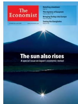
The Economist , October 8, 2005 issue on Japan's economic revival