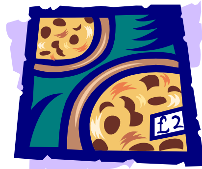
Yummm! Pizza for dinner on October 25th!

Pizzas will be par-baked (meaning you bake at home for another 8 minutes for freshness) and salads will come with dressings on the side. Please note that Pizzicato is requesting a minimum of split pizza orders. Please be sure to charge the highest price when splitting a pizza. We need a volunteer to deliver pre-orders to the Wilson bus stop that Tuesday. Any takers? Please contact Jill Punches at (503) 233-6075 or email at punches1@msn.com.