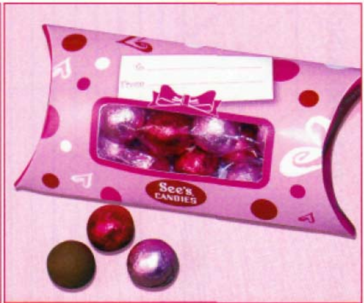
Polka Dot Gift Pack with Milk Chocolate Foil Balls