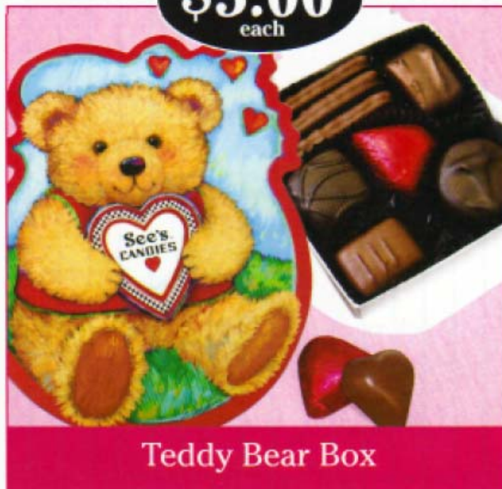
Teddy Bear Box