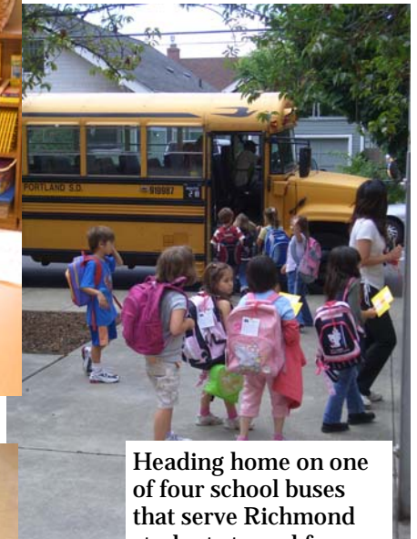
Heading home on one of four school buses that serve Richmond students to and from all four quadrants of the City of Portland.