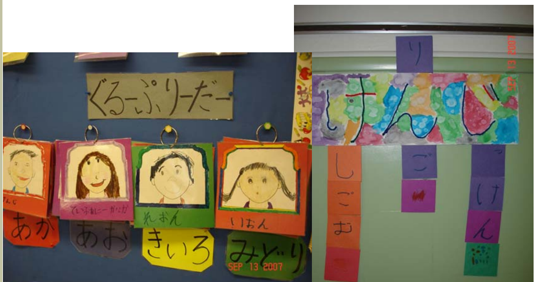
Samples of 1st grade writing in Japanese along with self-portraits. Look for this hallway display in our 1st grade wing of Richmond, located on the elevator side of the main floor.