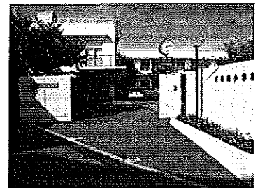
Entrance to Sumaura School

Our immersion program provides many wonderful opportunities for our students. It is incredible to watch our students change over time. One of the amazing benefits of our program is the opportunity to take part in cultural exchanges with our sister schools. Not only do these opportunities provide "real-world" experiences, they also provide a hands-on chance to use Japanese language skills.