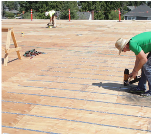
Partial roof replacement with seismic strengthening.