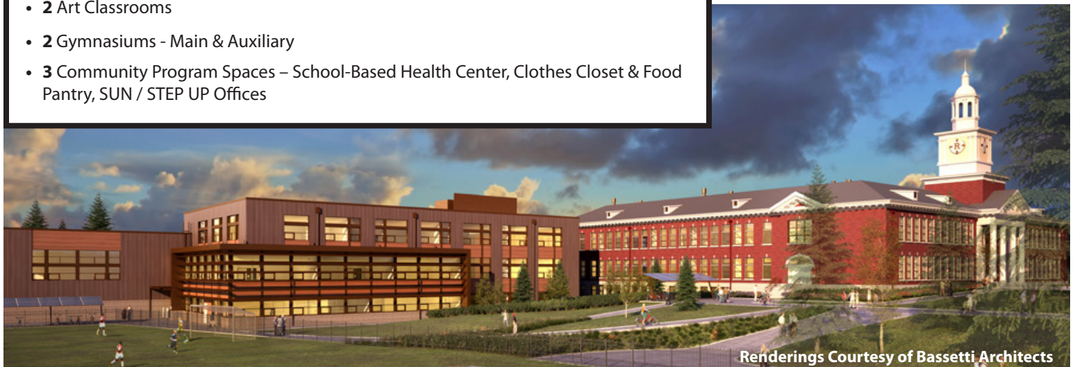
Renderings Courtesy of Bassetti Architects