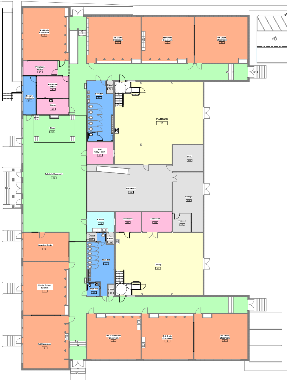
1 Main Building - Floor Plan A100 1/8" = 1'-0"