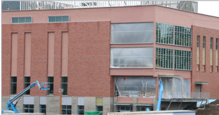
New Gym/Biomedical/Culinary Arts building nears completion