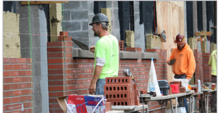
Brick finishing work